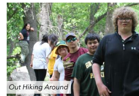
Out Hiking Around

temper, which gets her in trouble on a constant basis. I have had many opportunities to sit and have one-on-one conversations with her. She has hopes and dreams and I pray that God brings someone in her life to guide