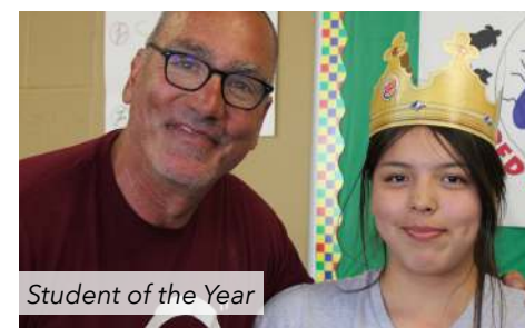
Student of the Year

One young lady in particular has touched me in such a way that I know why we do what we do. My heart breaks every time I sit with her. I met her at Red River Alternative Learning Center over a year ago and now she is at West Central Regional Detention Center. She has absolutely no family in her life. Her case worker has primary care of her. She struggles with her